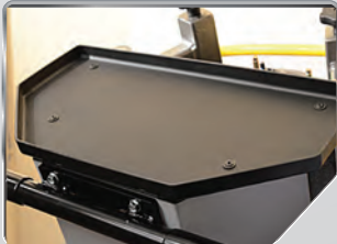
• Tool Storage Tray

Adjustable Extra Strong Clamps Single and double clamps are interchangeable to meet any position of the coils. Perfect grip every time.