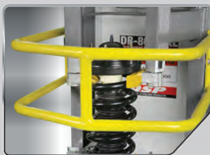
• Front Safety Guard

Safety Microswitch Prevents operating if guard is not correctly positioned.