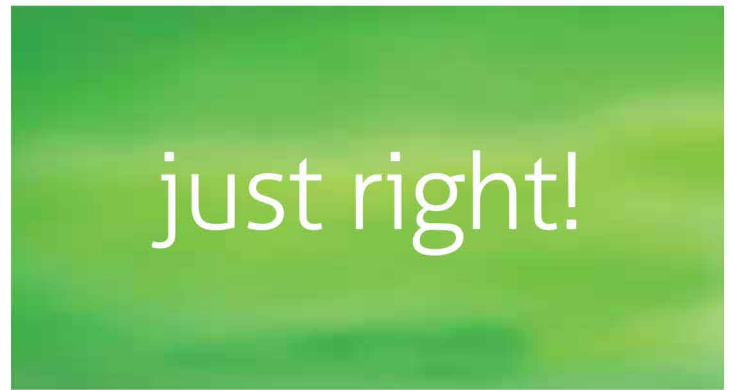
With ZOO Fans

ZOO Fans gently mix the air, eliminating hot and cold spots. The temperature at floor level is much more comfortable and the HVAC systems run less.