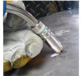
0.8mm Aluminum Hood