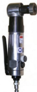
PLT-50/A Tip Sharpener (optional)

Quick & Easy to use tip sharpener. Get 50% more use out of your tips.