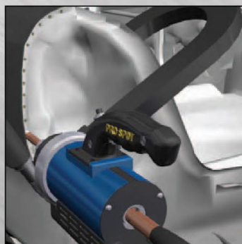
Consistent weld quality with short weld time.