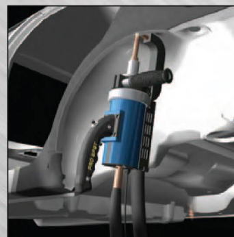
Wheel House welding with PS-52 Arm makes it possible to weld the most difficult applications.