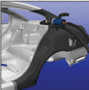
Spot welding of quarter panel using C-Arm (PS-302).