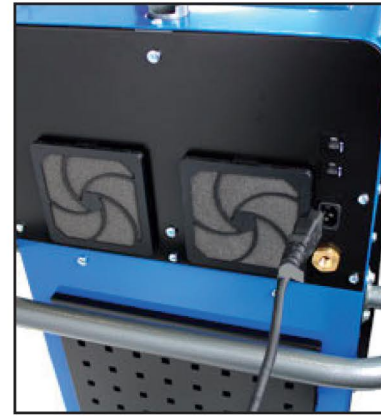
Charging system for on-board batteries (4).

Convenient 110V/220V outlet on back for easy re-charging! Can also be charged while welding. Load test of battery system included.