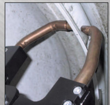
X-Adapter Arm is a must for tight areas with limited space for the electrodes.