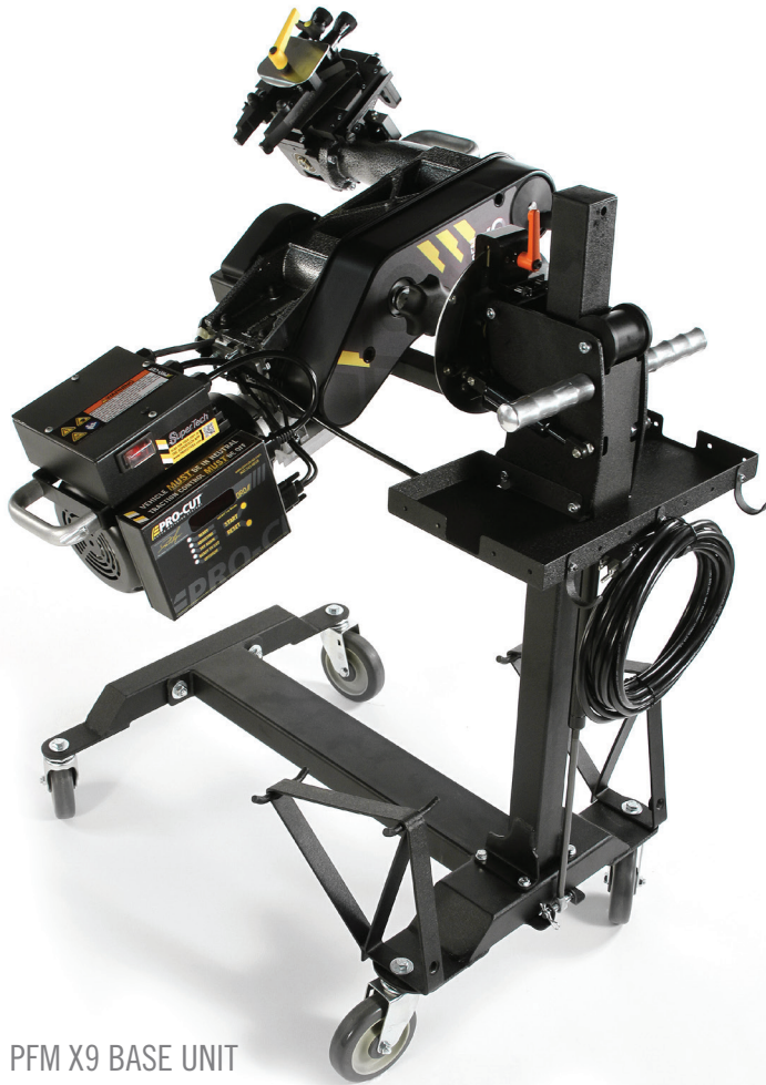
PFM X9 BASE UNIT