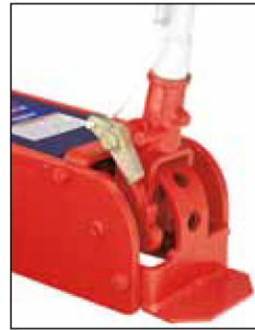
FASTJACK® mechanism raises the jack's lifting saddle to the load in one pump stroke.

Heavy duty truck, heavy construction and agricultural equipment maintenance garages.