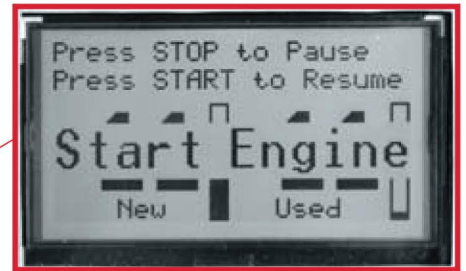
Easy to follow prompts