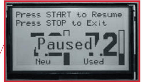
Ability to stop during service