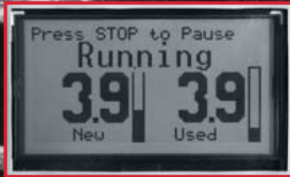
...flush in progress...