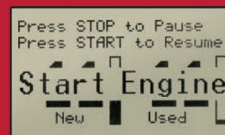
Easy to Follow Prompts