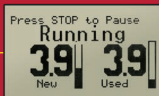
...Flush in Progress...