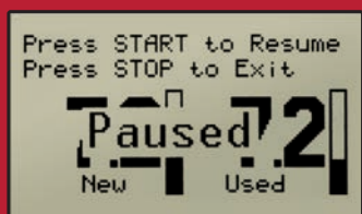
Ability to Stop During Service