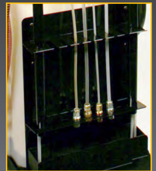
Adapter organizer with removable drip tray