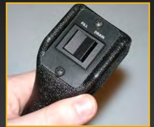
Fingertip controlled pendant with 11' reach allows one tech service.