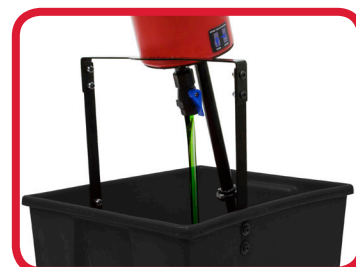
Drains easily into included waste container