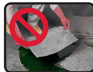
NO soggy absorbent pads