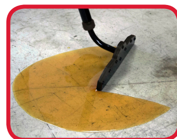
Cleans up fluid spills with ease