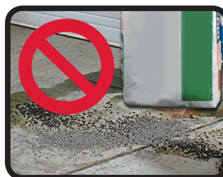
NO contaminated pellets