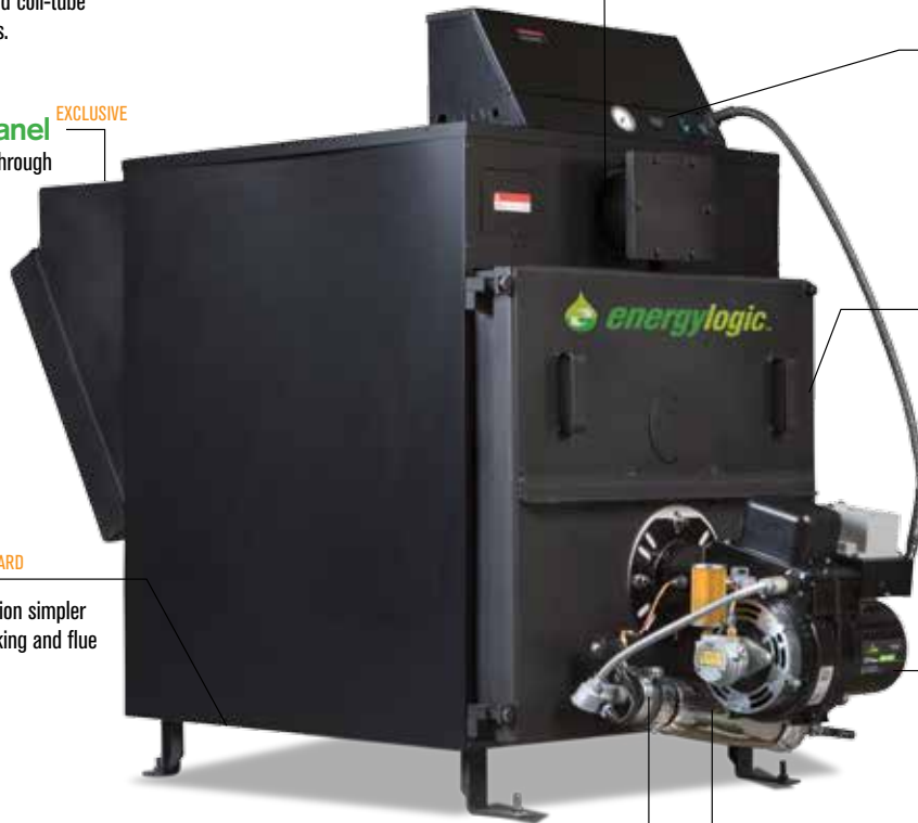
Pictured: 375B boiler

Rapidly heats the widest range of viscosities of used oil, synthetic oil and other acceptable fuels.