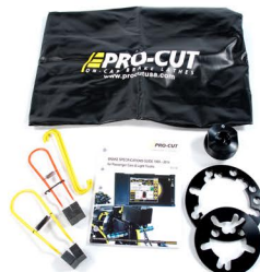
201-50-ACC Accessory Kit