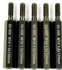
201-50-005 14mm x 1.5 Stand Offs