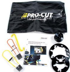
201-50-ACC Accessory Kit

Contact your Ford Field Service Engineer or your Rotunda Area Sales Manager: