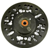
201-50-935 Dual Wheel Adapter