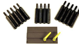
201-50-492K (For standard cutting head) Reach Extension Kit