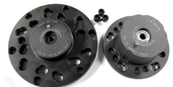
201-50-TRANSIT 2015 Full Size Transit Single and Dual Wheel Adapter Kit