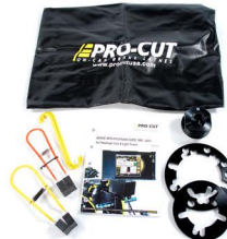
201-50-ACC Accessory Kit