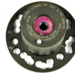
201-50-695 5 & 6 Lug Adapter