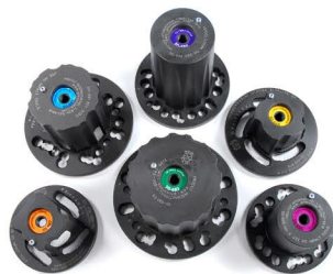
201-50-6ADP 6 Adapter Package