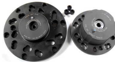
201-50-TRANSIT 2015 Full Size Transit Single and Dual Wheel Adapter Kit