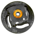
201-50-687 4 Lug Adapter