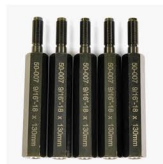
201-50-007 9/16th Stand Offs