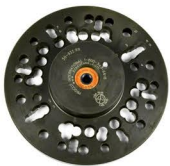
201-50-935 Dual Wheel Adapter