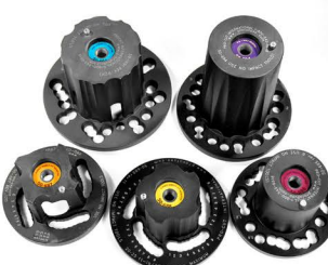
201-50-5ADP 5 Adapter Package