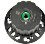
201-50-683 8 & 10 Lug Adapter