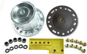
201-50-999KIT Medium Duty Truck Kit