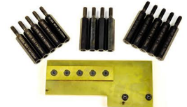
201-50-1492KIT (For Optional Cutting Head) Reach Extension Kit