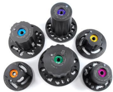
201-50-6ADP 6 Adapter Package