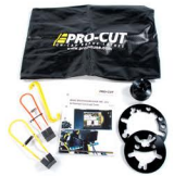
201-50-ACC Accessory Kit