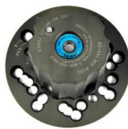
201-50-691 1/2 Ton Truck Adapter