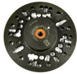
201-50-935 Dual Wheel Adapter