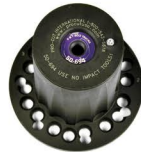
201-50-694 F150 / EXP. Adapter