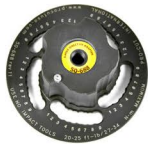
201-50-688 5 Lug Adapter