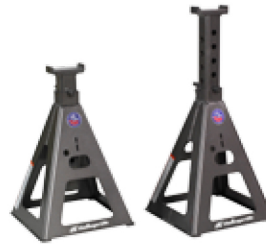
CLHM-10-TH Short Support Stand 20,000 lb. capacity each, adj. height of 20" - 32", 1" adjustment increments (1 pair)