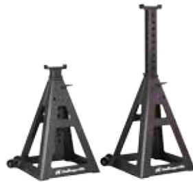
CLHM-10-THF Med. Support Stand 20,000 lb. capacity each, adj. height of 30" - 52", 1" adjustment increments (1 pair)