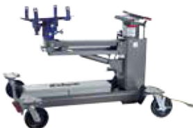
CLHM-HTCJ-2000 Transmission Jack 2,200 lbs. capacity, 30" start height, max. height of 72", 360° rotating head with fore and aft tilt, 1st stage power: 100% air, 2nd stage power: air/hydraulic for precise control