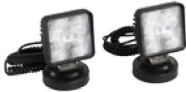
CLHM-LS-LK Light Kit (pair) Illuminate work areas under the vehicle. Plugs into sockets located on columns. 2 lights per kit (order 1 per column)