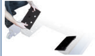
CLHM-LSA Small Wheel Adapter Accommodates 14" wheels, 2 pieces per kit (order 1 per column)