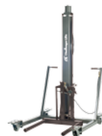
CLHM-WDH-12 Wheel Dolly 1,200 lbs. capacity, max lifting height of 51", air assisted hydraulic power system, flexible design works with super single & dual wheel assemblies, combines fore/aft & side to side tilt adj.